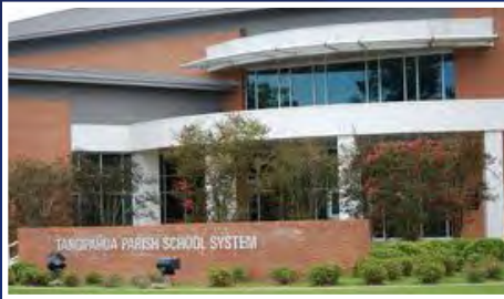
Tangipahoa Parish School District